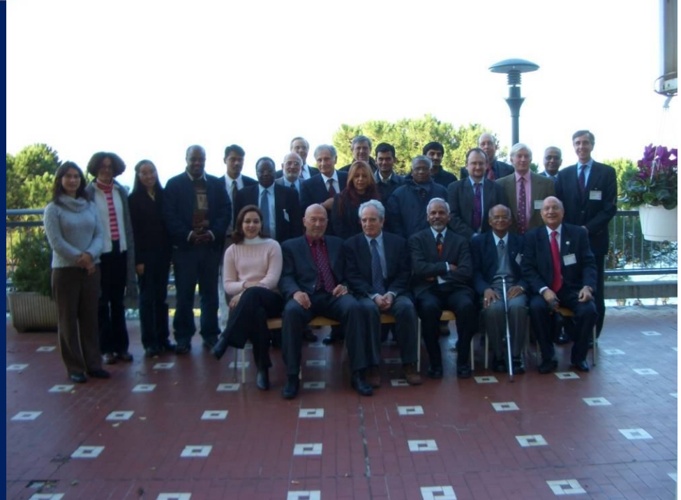
ICTP Top Experts Meeting on Renewable Energy