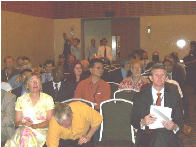
Perth Australia February 2007