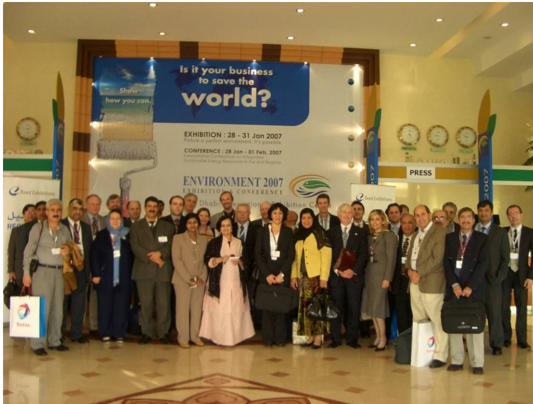
Abu-Dhabi Environment 2007 January 2007