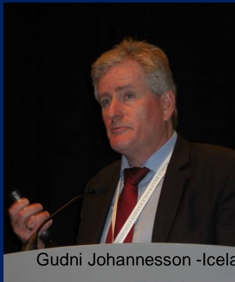
Gudni Johannesson -Iceland