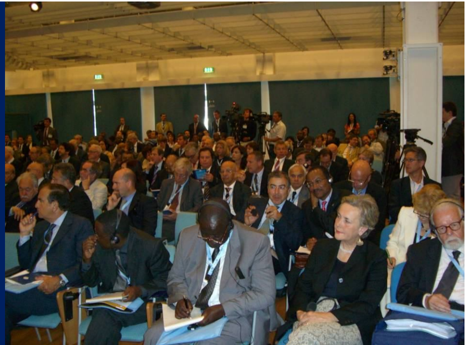
G8 UNESCO World Forum, Trieste, Italy, May 2007