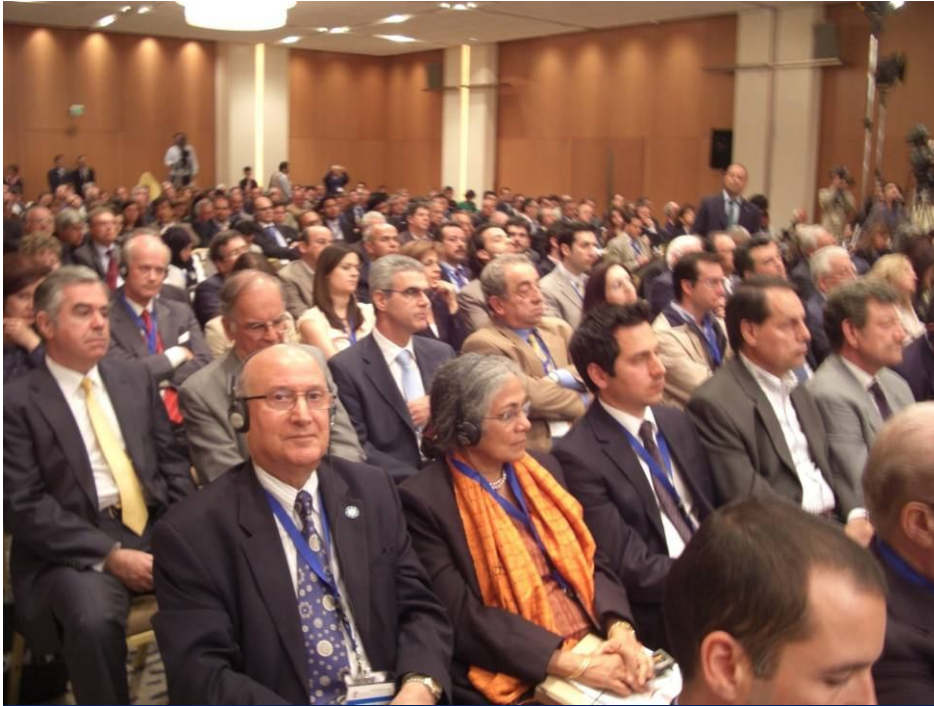
Athens Summit Greece, May 2008