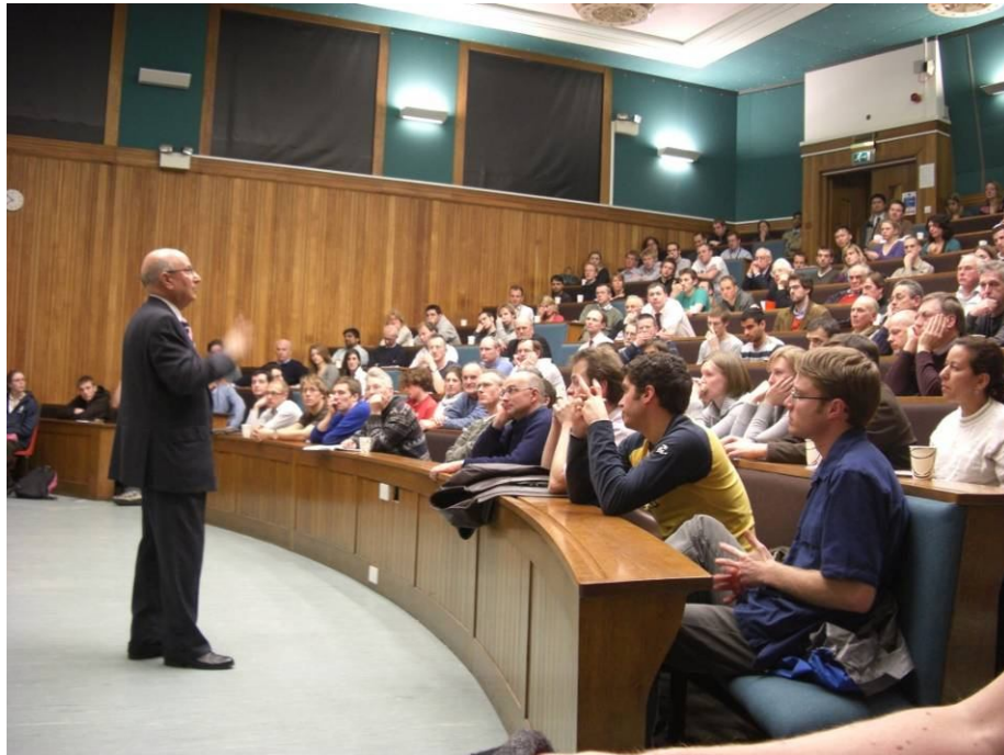
Lecture on Renewable Energy at Bristol University February 2008 for IET