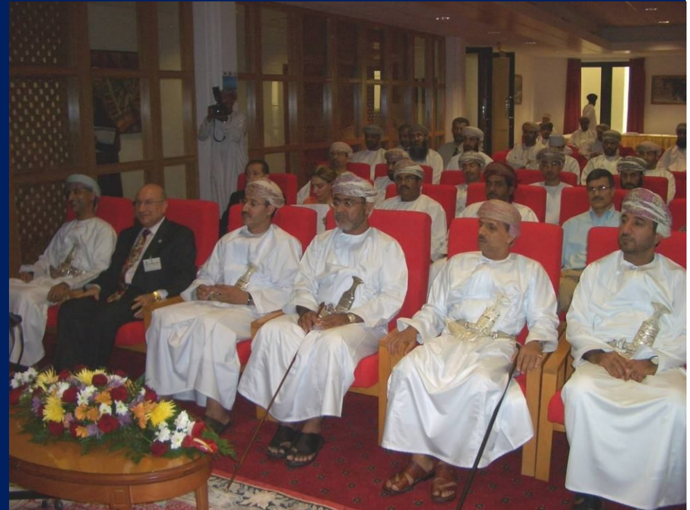
Sobar Univ., Oman Symposium March 2007