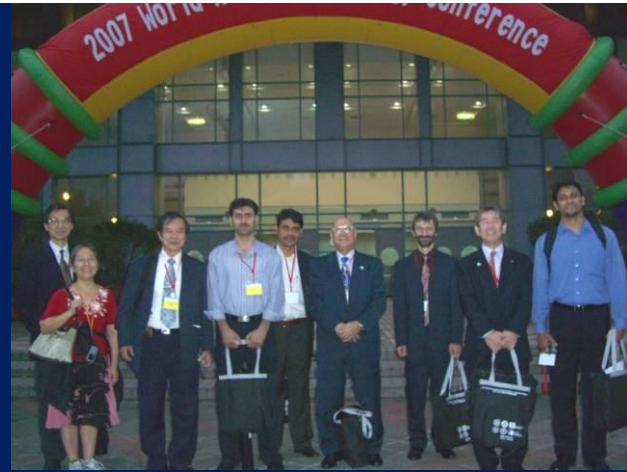
Taiwan November 2007