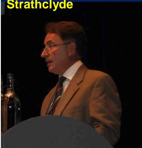
Vice Chancellor of Strathclyde