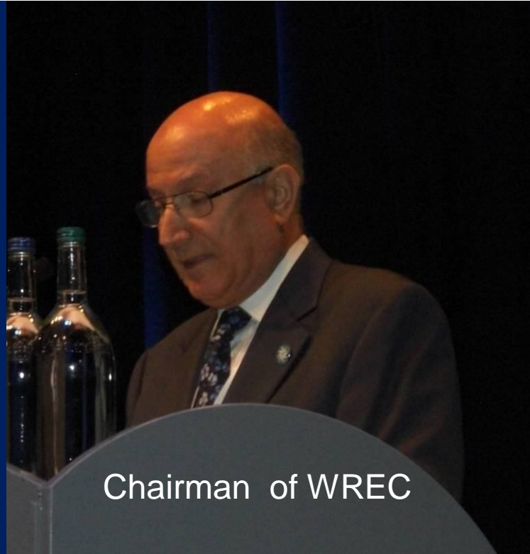
Chairman of WREC