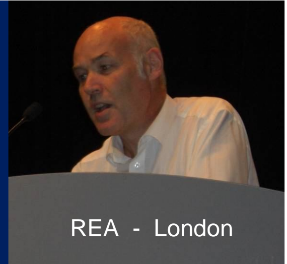
REA - London