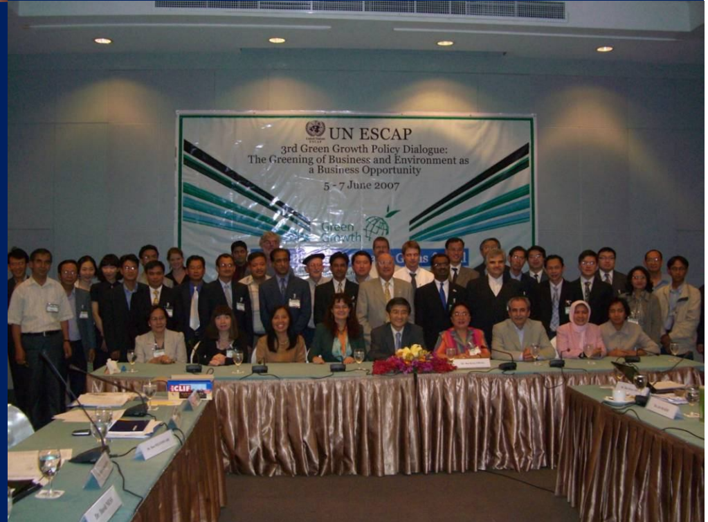
UN ESCAP Lecture Bangkok Thailand June 2007