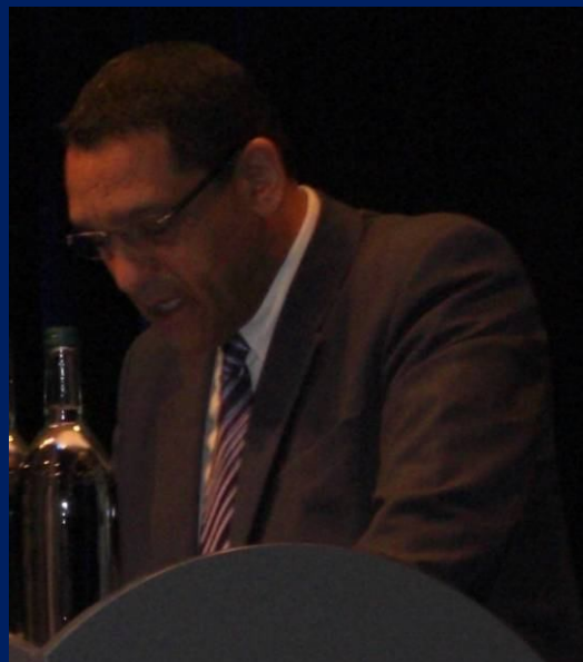
Director of Energy UNESCO