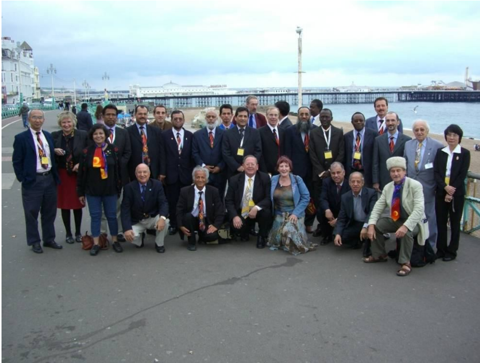
WREN International Seminar in Britain October 2007