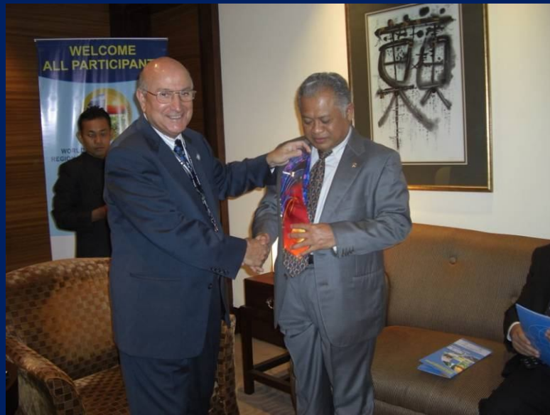
Jakarta Indonesia – October 2007