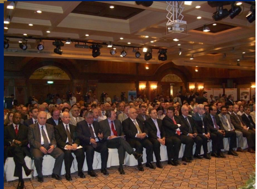
MENAREC Damascus Syria June 2007