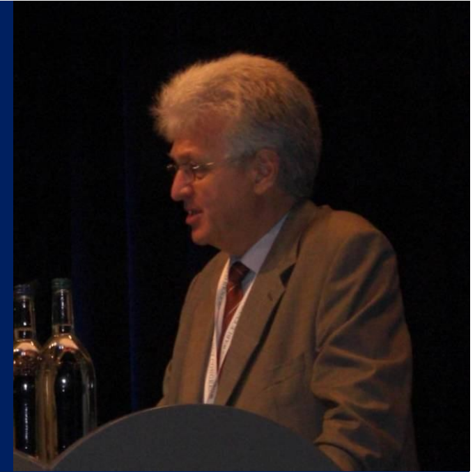
Director of Energy EC