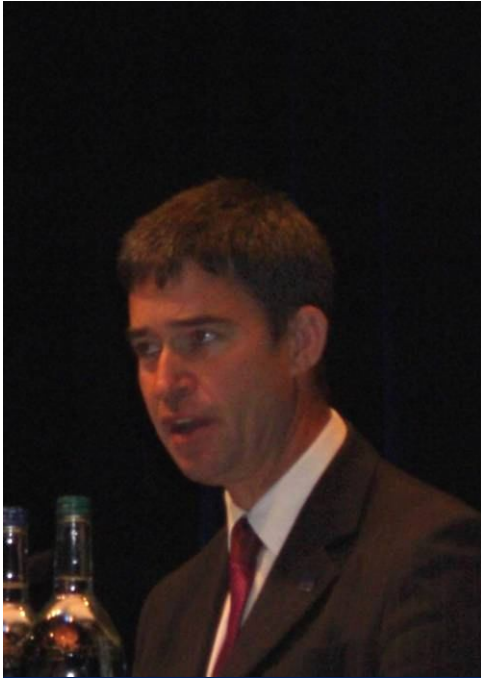
Director of BRE