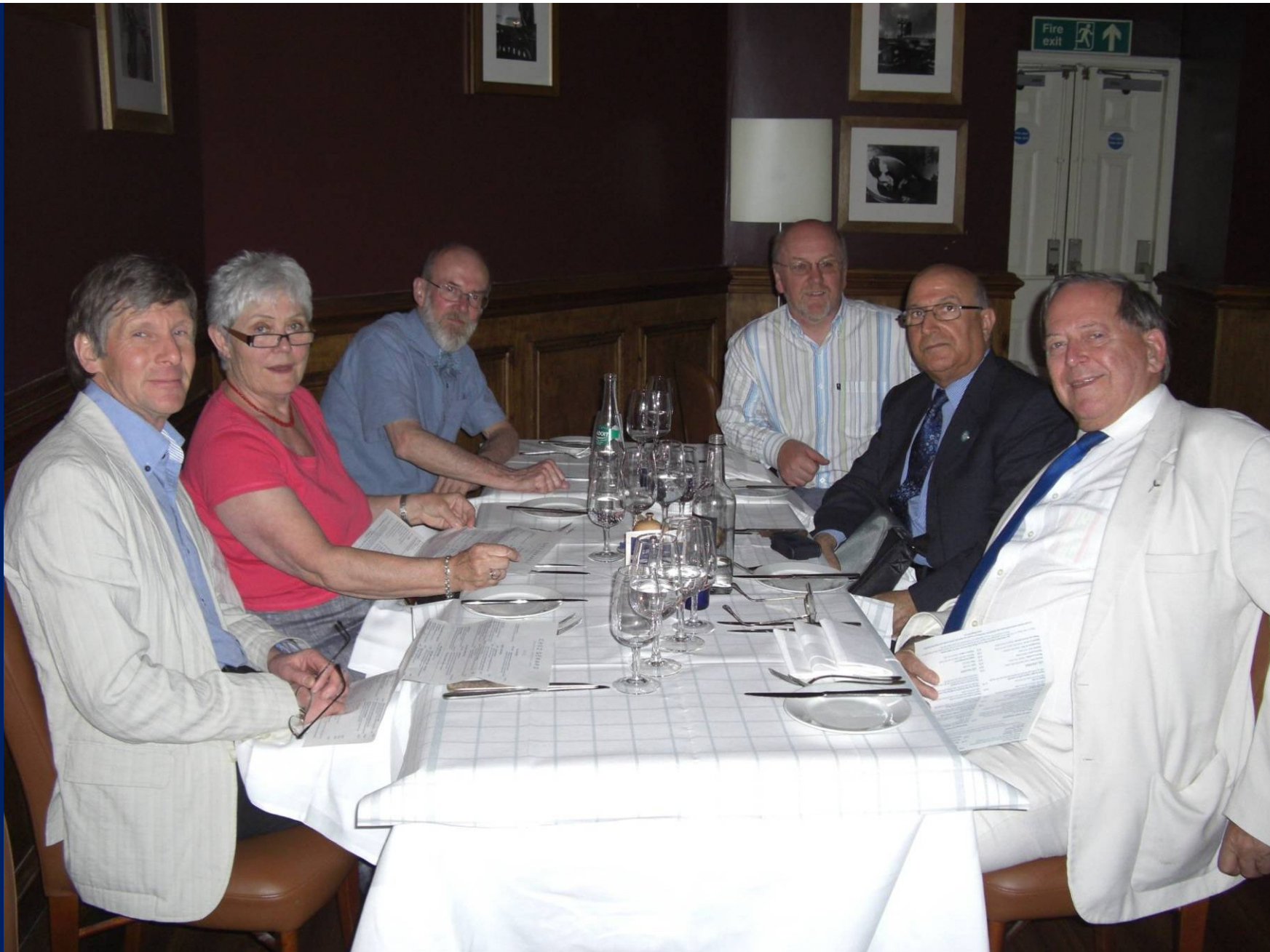
WREN Trustees Meeting July 2008