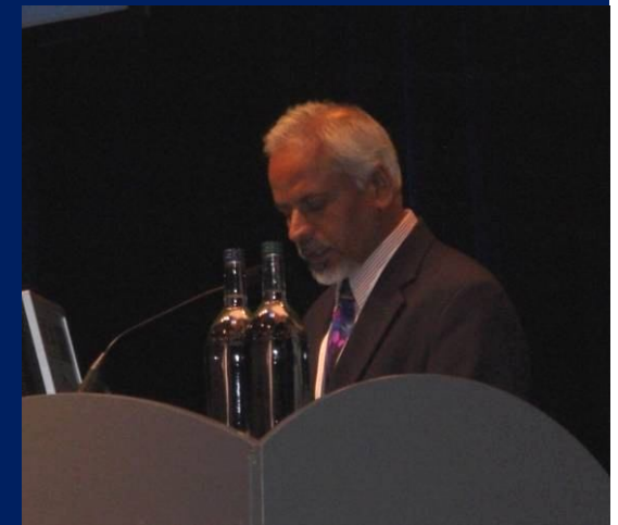
Director of ICTP