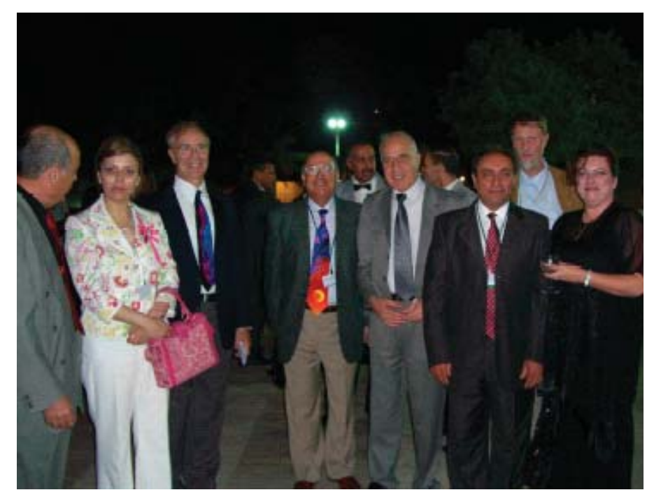
WREN Associates at the Conference Reception

<u>Recognizing</u> that Renewable Energy Development and Energy Efficiency measures can strongly contribute to climate protection, energy security, Job creation and sustainable economic development;