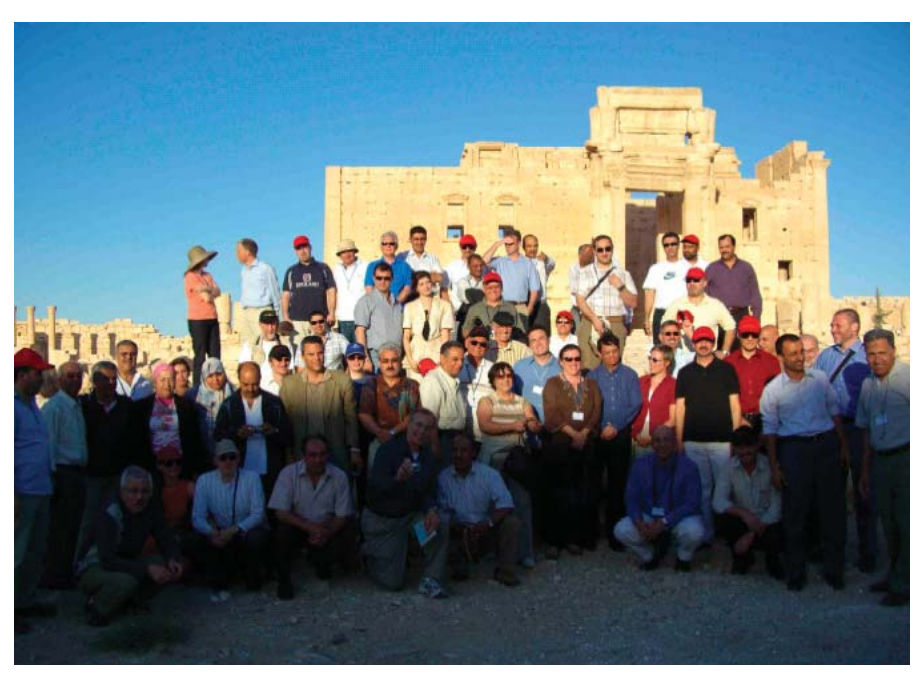
Visit to the Palmyra ruins